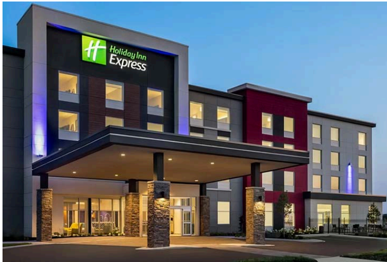
Holiday Inn Strathroy - Opened in 2022