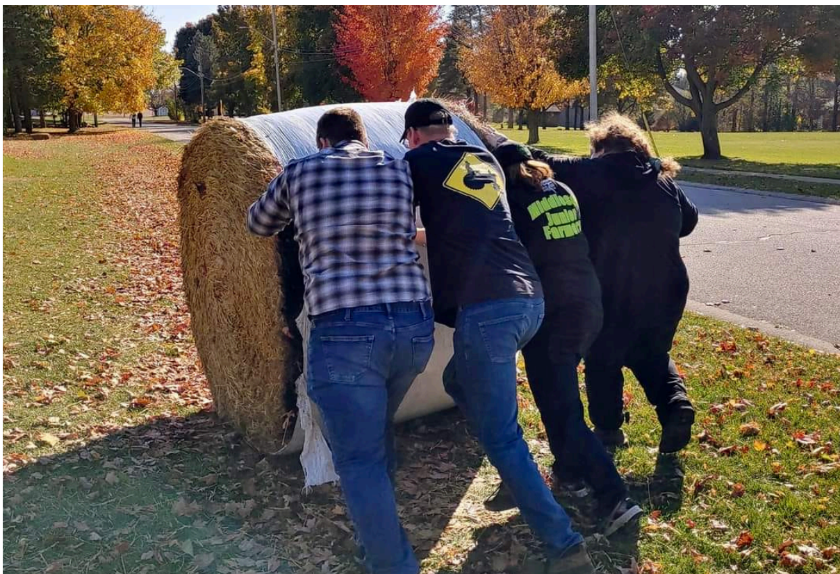
Example of an Autumn Profile Event

Any questions or concerns can be emailed to: middlesexjf@gmail.com